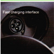
Fast charging interface