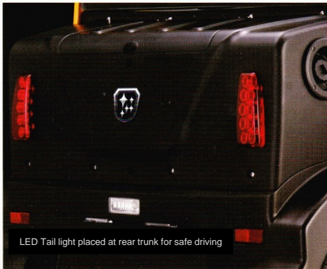
LED Tail light placed at rear trunk for safe driving